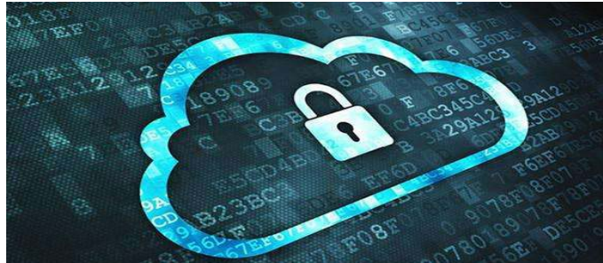
Figure 1 Building full chain innovation

has vigorously supported new industries such as e-commerce, science and technology, and Internet[1]. Judging from the overall development situation of the country, the quantity and comprehensive quality of talents determine the future development direction of economy and science and technology, relying on the dual driving force of new knowledge and theory, in the process of market activity and scientific and technological exchange, enterprises can get more power, science and technology can find more blind spots, and obtain new opportunities for rapid development while breaking through the original pattern.