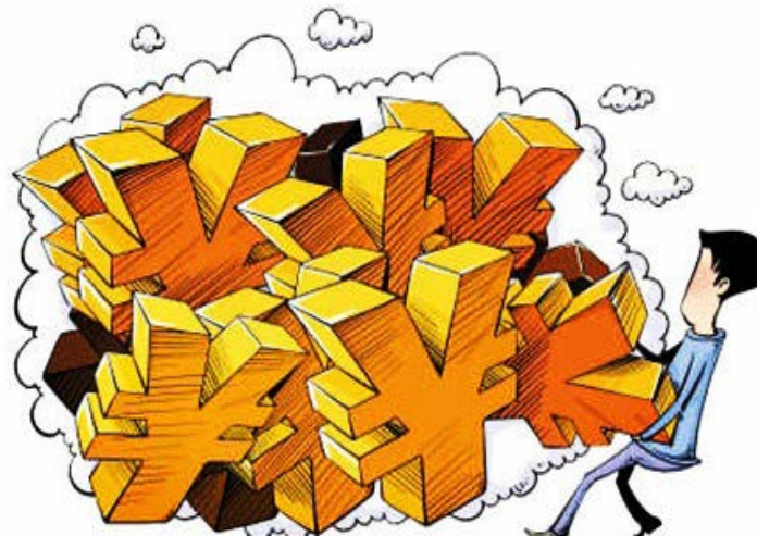
Figure 3 Building full chain innovation

Taking figure 3 as an example, the comprehensive quality of talents determines the economic benefits in the future. In order to carry out the talent training plan, it is necessary to reorient the comprehensive development direction of colleges and universities on the basis of the original teaching activities, transform the university into a platform to drive the development of innovation process while carrying out culture and education, establish a qualified innovation system, cultivate the innovative spirit of college students, stimulate their independent thinking ability, innovative entrepreneurial ability, cooperative spirit and basic responsibility, and promote the innovation strategic development of our country in an all-round way[3].